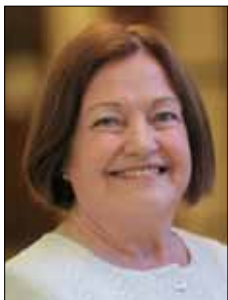
Mairead Maguire

Excerpts from an appeal by Mairead Maguire*