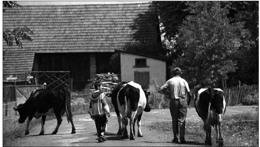
“Rural management views nature as an entrusted good with which it interacts. It is a culture of dealing with the living.” (picture caro)

horticultural patterns of cultivation of all advanced civilisations with scarce land and high population densities. This type of cultivation also saved our lives in times of need during the Second World War.