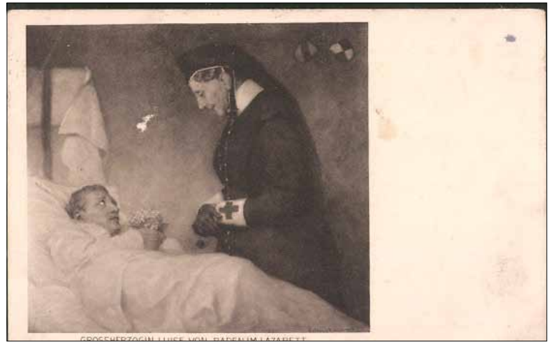
Postcard from 19 th century

We “westerners”, however, lived in a different world from those “in dr’Schdad” (“in town”). In the fifties it still had a semi-rural character with three farms. At the time, I